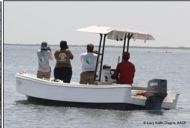
Atlantic humpback dolphins photographed in March, 2022 in the Saloum Delta in Senegal. The survey team is pictured in the lower lefthand corner.